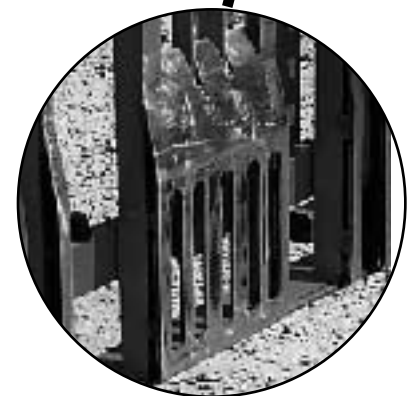
Optional Slotted Plates